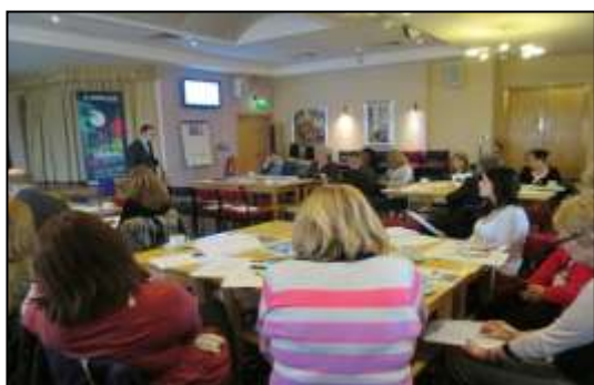
Attendees at the HWD Choose Well and Herbert Protocol event in February 2015

The information session on The Herbert Protocol was jointly presented by The Alzheimer's Society and South Yorkshire Police. At the time of the event the protocol had only recently been introduced into South Yorkshire and the information was very well received. The Herbert Protocol is a risk management and information gathering tool for when a person with Dementia is reported missing.